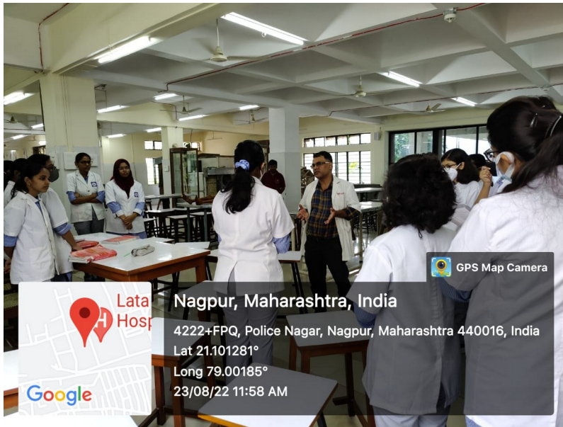
CBL On Prostate 23/8/22