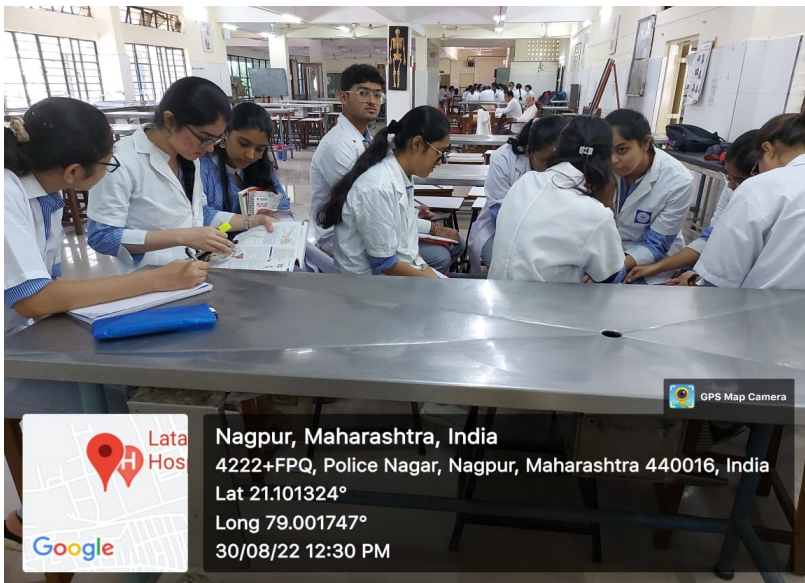
CBL On Urethra