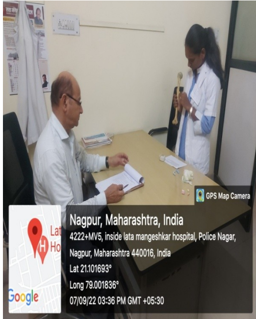
OSPE on 07/9/22