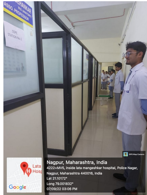
OSCE on 07/9/22