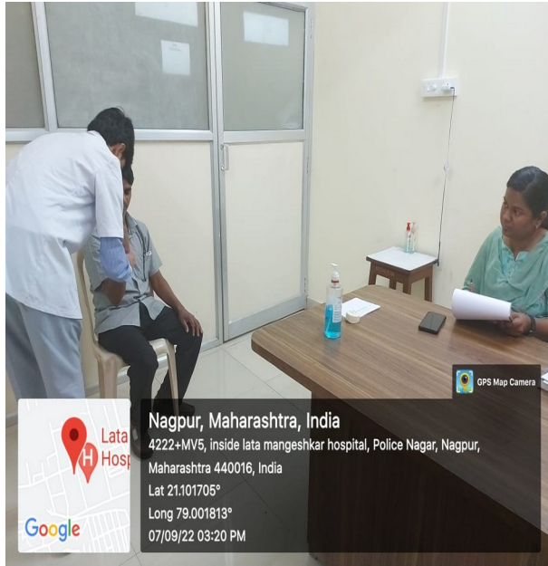
OSCE on 07/9/22