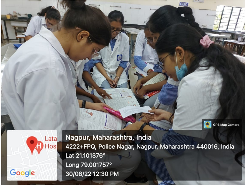
CBL On Urethra