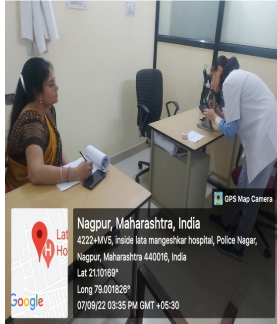
OSPE on 07/9/22