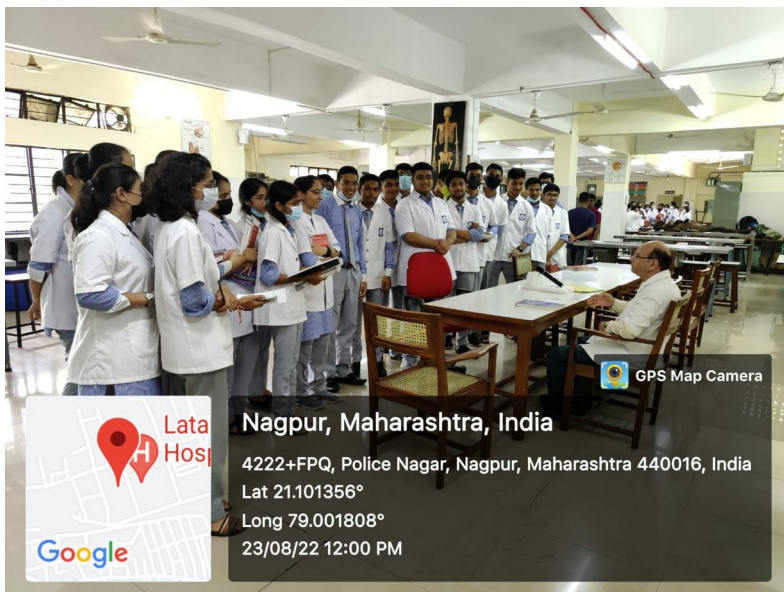
CBL On Prostate 23/8/22